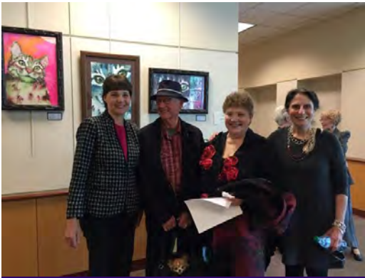
Pictured top are some BAA artists, City Hall, and bottom are the mayors of Brownsville & Albany, as well as artists from Gallery Calapooia!